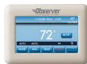
TSTAT0201CW (Sold Separately)

* For residential applications only. See Warranty certificate for complete details and restrictions, including warranty coverage for other applications.