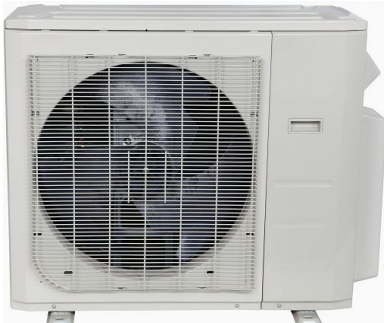
AHRI Certificate Reference No. 206315653