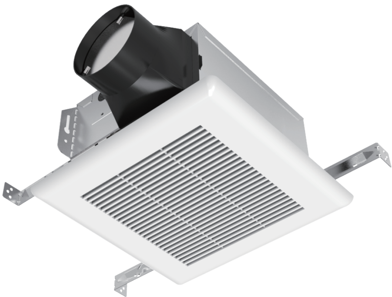
Optional LED Light grille